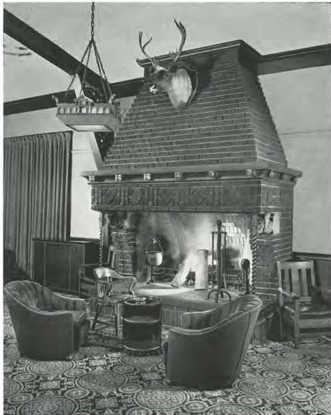
THE FIRE PLACE

It should be recorded that during the war years we had a great number of visits from the Norwegian Flyers in Toronto. Around Christmas and Easter many of them had the Club as some sort of headquarters. Great efforts were made to do something for all Norwegian forces in the field, seamen, flyers and soldiers.