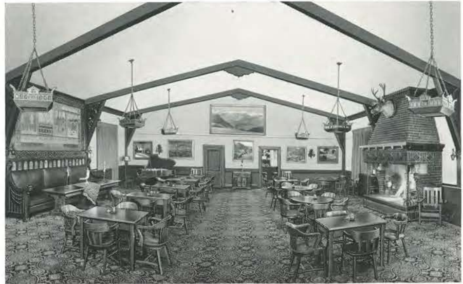
MAIN CLUB ROOM

Our present Home was started in November, 1916, and on July 1st, 1917, the building was completed. The ground cost $4,750.00 and the building $21,000.00 exclusive of furnishings.