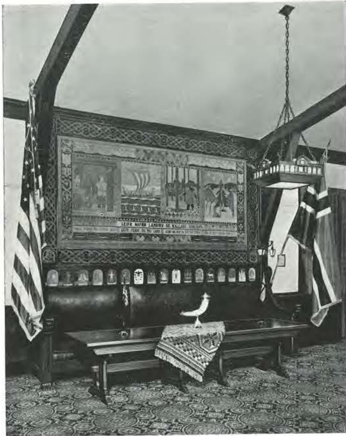
THE HIGH SEAT DECORATION BY EMIL BIØRNS

wine was a costly and much appreciated liquid in the North, Leif named the country Vinland, a word which may mean Wineland or Vineland.