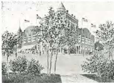
OLD HALL LOCATED AT MILWAUKEE AND KEDZIE AVENUES

The first goal was to obtain a suitable meeting place, as the temporary quarters, Wabansia Hall, were not at all satisfactory.