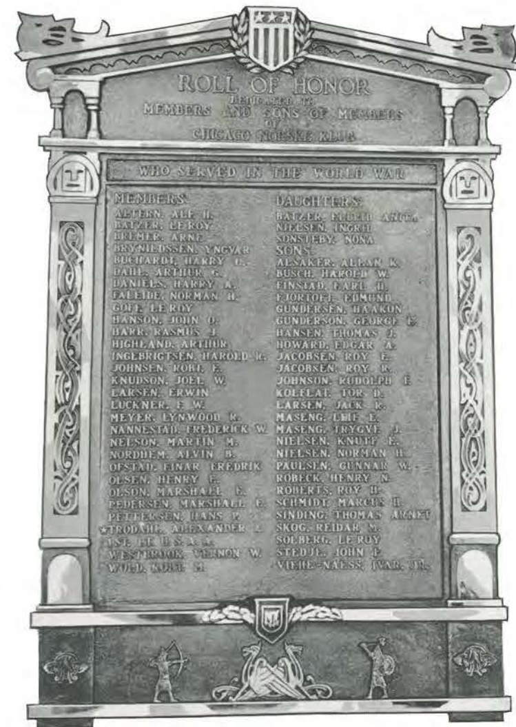
SECOND WORLD WAR ROLL OF HONOR