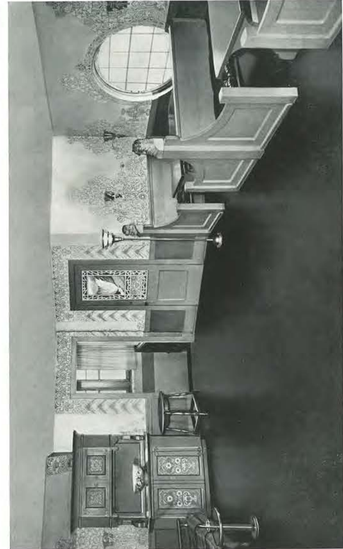
THE THIRD FLOOR ROOM — DECORATED BY BEN BLESSUM CLUB OFFICE IN BACKGROUND

I say this on this occasion, because I have also previously experienced results from the same interests from Chicago when I was commanding