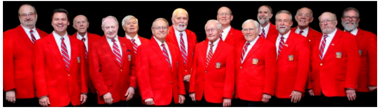
Normennenes Singing Society—Founded October 30, 2870