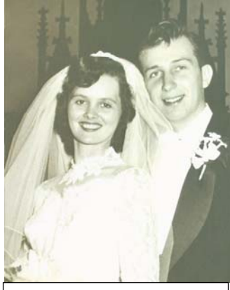
The Newgards on Oct. 15, 1955